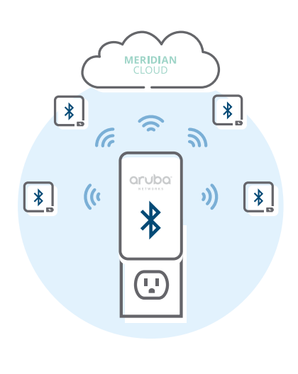
ARUBA SENSOR MANAGES ANY ARUBA BEACONS OR ARUBA TAGS WITHIN A 25 METER RADIUS, AND SYNCS DATA WITH THE MERIDIAN CLOUD OVER YOUR WI-FI NETWORK.